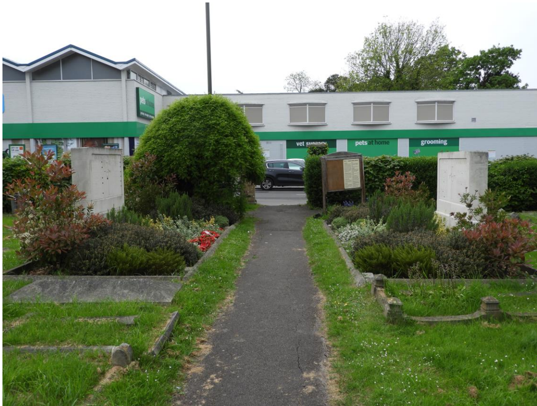
Screen Wall Memorials in Walton-On-Thames Cemetery