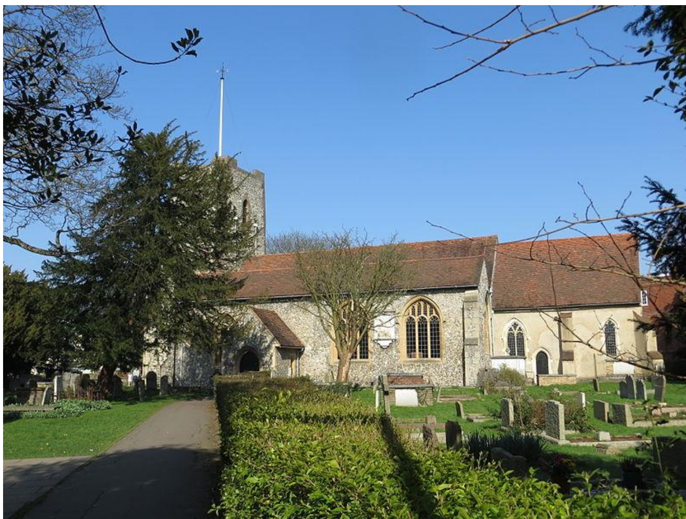
St. Mary's Churchyard Walton-On-Thames

The commemoration of the casualties is on Screen Wall monuments rather than individual headstones as some graves contain more than one burial. Two plots containing eight grave spaces are directly in front of the two Screen Walls and the other plots are elsewhere in the graveyard.